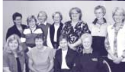
Conference Task Group