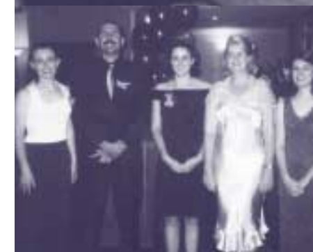
Queensland O'Malley scholars congratulated on World Home Economics Day