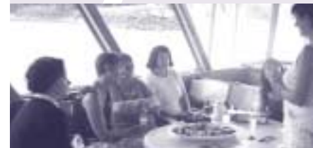
HEIA(NT) members enjoy an evening cruise as they address food and hospitality issues